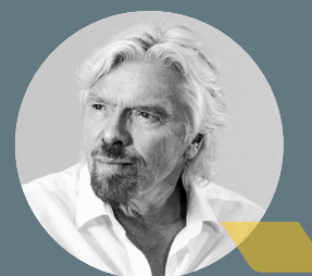
Richard Branson Founder & Chairman of Virgin

// We like to give people the freedom to work where they want, safe in the knowledge that they have the drive and expertise to perform excellently, whether they are at their desk or in their kitchen. Yours truly has never worked out of an office, and never will.