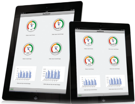
Online Dashboards for Android and Apple iOS devices

☎ 01278 421020 ✉ sales@axisfirst.co.uk ☎ 01278 451198 🌐 www.axisfirst.co.uk