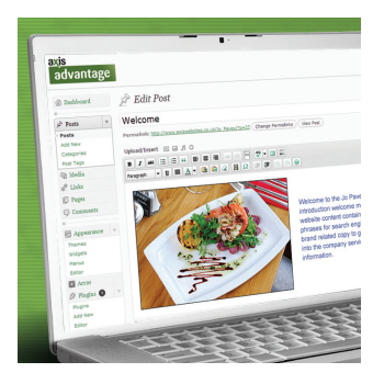
EASY TO USE CMS WEBSITES TO GET YOUR PRODUCTS UPDATED ONLINE INSTANTLY