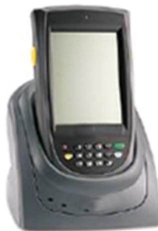
Hand Held Stock Control Device on its docking station/recharger

The devices connect to your server using a protocol known as RDP (Remote Desktop Protocol), which means that your server must be capable of providing Terminal Services.