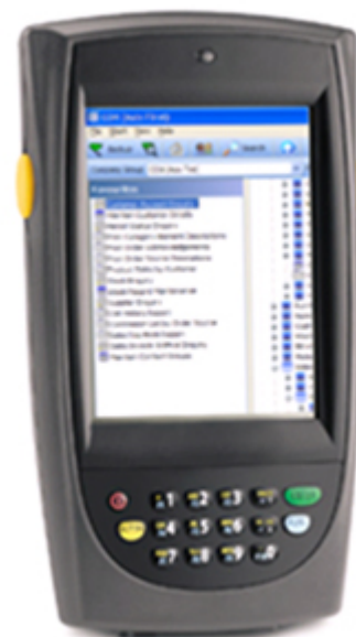
Hand Held Stock Control Unit with integral bar code scanner