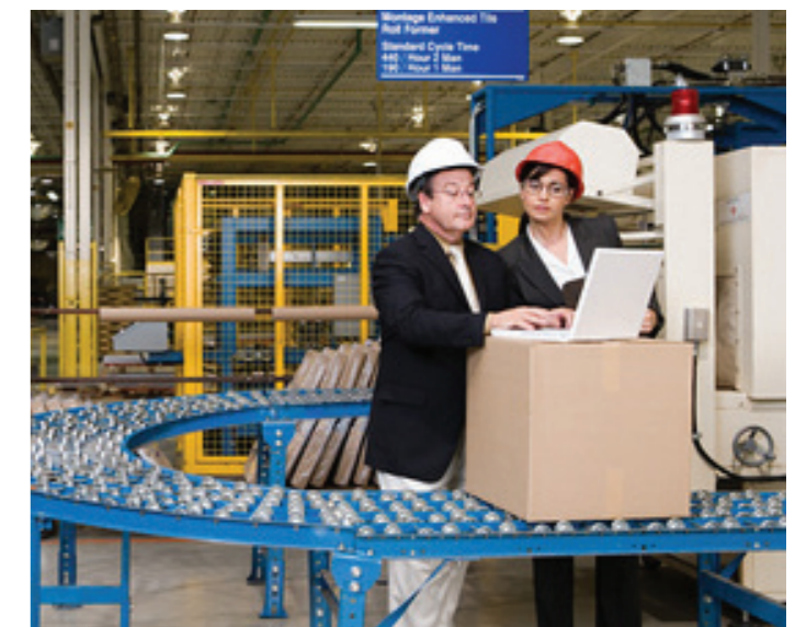
“SOFTWARE FOR WAREHOUSE MANAGEMENT - AN END TO END SOLUTION.”

At the end of picking, items can be released directly to an invoice that can automatically send a delivery note to a nominated printer, or to a further stage pending dispatch and invoicing.