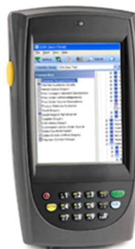
Hand Held Stock Control Unit with integral bar code scanner