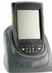
Hand Held Stock Control Device on its docking station/recharger

The devices connect to your server using a protocol known as RDP (Remote Desktop Protocol), which means that your server must be capable of providing Terminal Services. You will also need axis diplomat 2004 or above in order to support the Hand Held Stock Control Module.