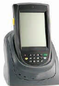
Figure 3 - Hand Held Stock Control Device on its docking station/recharger

You will also need AXIS Diplomat 2004 or above in order to support the Hand Held Stock Control Module.