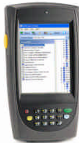
Figure 1 - Hand Held Stock Control Unit with integral bar code scanner