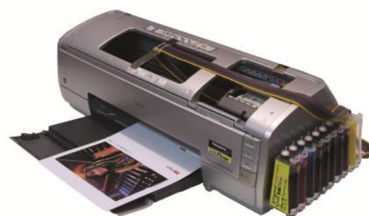
Fotospeed specialise in both traditional darkroom supplies and digital photographic media