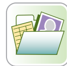
IMAGE & MEDIA MANAGEMENT

Below is just a small selection of axis® advantage modules you can pick and choose from to customise your CMS website: